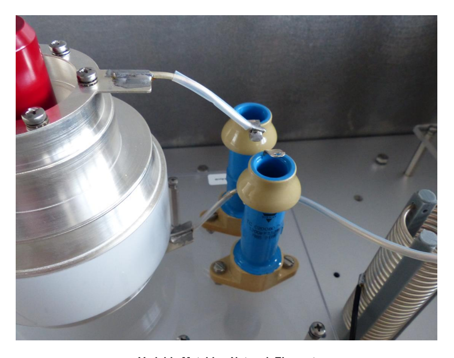
Variable Matching Network Element